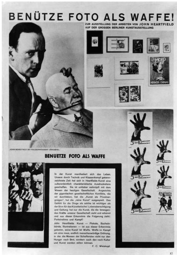
Figure 1. John Heartfield, Self-Portrait , 1929. Courtesy Akademie der Künste, Berlin. Kunstsammlung, Inv. Heartfield 1491/KS-FS-JH 318. © 2008 Artists Rights Society (ARS), New York/VG Bild-Kunst, Bonn

1928, Zörgiebel prohibited all outdoor meetings and demonstrations in response to violent street clashes between and among communists, socialists, and National Socialists. He then extended the prohibition to include the May Day marches, a highly symbolic annual working-class tradition (socialist as well as communist) that demonstrated working-class pride and solidarity. The communists, taking this gesture as provocation by the socialist regime, appeared en masse to protest Zörgiebel's prohibition peaceably, only to be met by specially