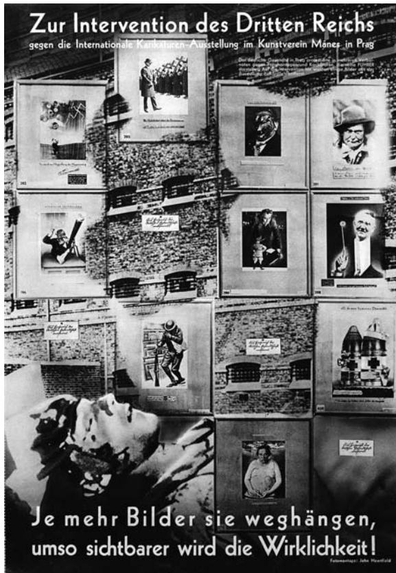
Figure 9. John Heartfield, Zur Intervention des Dritten Reichs ( On the Occasion of the Intervention of the Third Reich ), 1934. © Bildarchiv Preußischer Kulturbesitz, Berlin. © 2008 Artists Rights Society (ARS), New York/VG Bild-Kunst, Bonn

insight, because we cannot transcend our creaturely existence as ideological subjects. To some degree or another, we are all Cabbageheads.