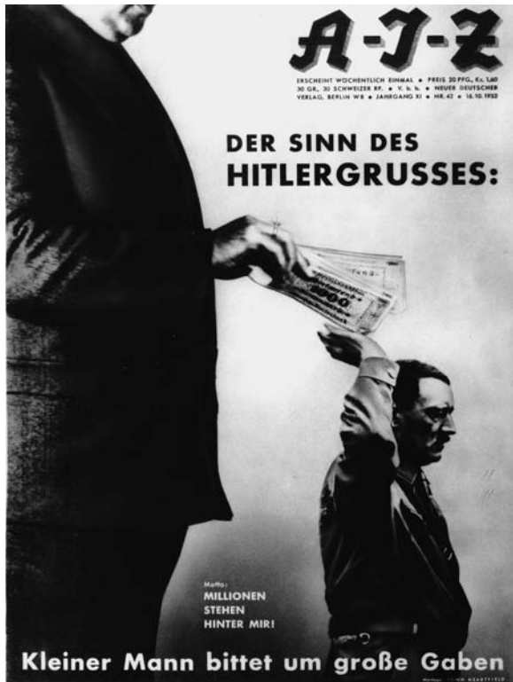
Figure 5. John Heartfield, Der Sinn des Hitlergrusses ( The Meaning of the Hitler Salute ), 1932. Courtesy Akademie der Künste, Berlin. Kunstsammlung, JH-F-647. © 2008 Artists Rights Society (ARS), New York/VG Bild-Kunst, Bonn

asked to engage with them not as the material product of a series of choices, belief systems, and values but as a natural extension of the world “out there” presented to the viewer in unmediated fashion. We can understand the insistent seamlessness in Heartfield’s AIZ work—its pictorial suture—as an allusion to the illusions, asking the beholder to indulge in their fictions while undermining them through incongruity, distortion, and wordplay.