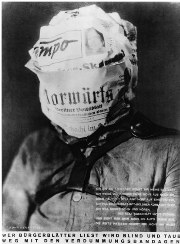
Figure 3. John Heartfield, Wer Bürgerblätter liest wird blind und taub! (Whoever Reads Bourgeois Papers Becomes Blind and Deaf!) AIZ, 1930. Courtesy Akademie der Künste, Berlin. Kunstsammlung, JH-F-467, photograph by B. Kuhnert. © 2008 Artists Rights Society (ARS), New York/VG Bild-Kunst, Bonn

a deliberate rejection of disjunctive form. In this portrait a head, mummified by newspapers, asks its viewers by way of the prose in the lower-right corner: “I am a Cabbagehead, do you know my leaves?” Though inquisitive, the man can neither see nor speak, for he is blinded and muted by the newspapers that wrap themselves over his eyes and mouth, enveloping his head. Nor can he hear, according to the boldface type beneath the image, because “whoever reads bourgeois papers becomes blind and deaf.” The bourgeois press, in this instance, refers to Vorwärts , the press organ of the Social Democratic Party, and Tempo , a mainstream socialist paper. The violence of this image operates not on the register of vicious cut-and-paste but on that of psychological