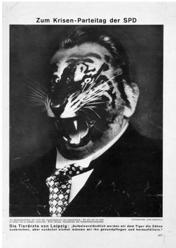
Figure 6. John Heartfield, Zum Krisen-Parteitag der SPD ( On the Occasion of the Crisis Party Conference of the SPD ), 1931. Courtesy Akademie der Künste, Berlin. Kunstsammlung, KS-FS-JH 2520, photograph by Roman März. © 2008 Artists Rights Society (ARS), New York/VG Bild-Kunst, Bonn

pin, insinuating that capitalism, socialism, Nazism, and death are analogous, as interpenetrable as the mutating death's-heads that effortlessly blend into the necktie's fabric. The event that occasioned this nightmarish visage was the 1931 Social Democratic Party conference in Leipzig, whose objective was to come to terms with the escalating world economic crisis. Heartfield's tiger-capitalist, white teeth bared, is an astringent response to the trade unionist Fritz Tarnow's remark: "Social democracy does not want the breakdown of capitalism. Like a doctor, it wants to try to heal and improve it." Tarnow, chair