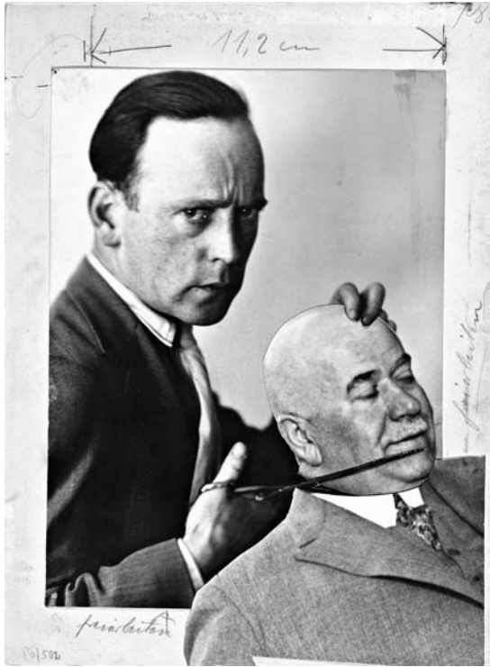
Figure 2. John Heartfield, Self-Portrait with Police President Zörgiebel , mock-up, 1929. Courtesy Akademie der Künste, Berlin. Kunstsammlung, Heartfield 430 © 2008 Artists Rights Society (ARS), New York/VG Bild-Kunst, Bonn

magazines, or Illustrierten , flooding the German market during the 1920s. With a print run of nearly five hundred thousand, it was the second most popular Illustrierte in circulation, outsold only by the left-of-center Berliner Illustrierte Zeitung ( sic ), whose readership extended into the millions. 6 Geared toward a broad-based, left-wing readership, the purpose of the AIZ was to propagate a communist viewpoint to nonparty members and the so-called homeless Left. Its brilliance lay in its ability to speak to the broad spectrum of